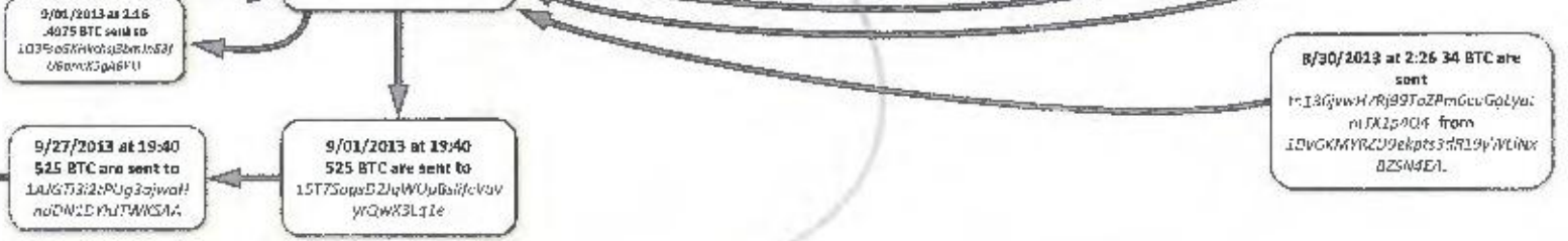
All times are UTC (Coordinated Universal Time)